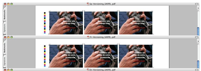
Versioning with DynaStrip Fusion

Advanced imposition, combined with versioning capabilities for printers handling multilingual documents, catalogues and direct marketing campaigns. You can build up to 200 versions of the same job.